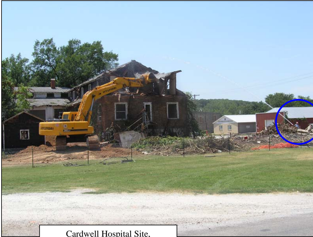
Cardwell Hospital Site, Dust suppression application. (circled in blue)