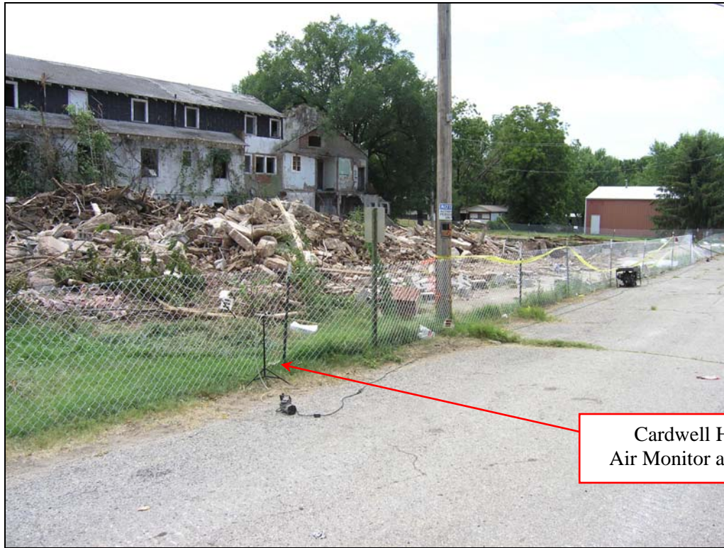
Cardwell Hospital Site, Air Monitor at Site Perimeter