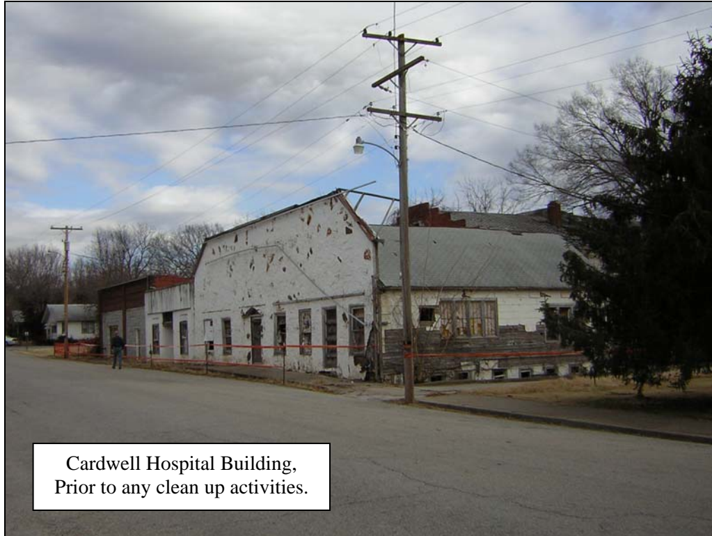
Figure 2 Cardwell Hospital Building Before and During Demolition Cardwell Hospital Site Stella, Missouri