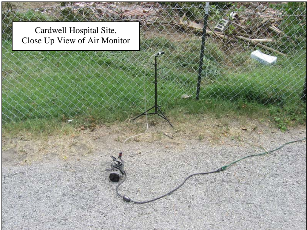
Cardwell Hospital Site, Close Up View of Air Monitor